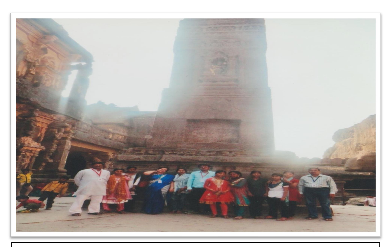
The College Student at Ellora Caves