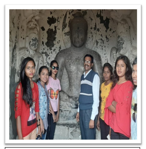
The College Student at Buddha caves, Aurangabad