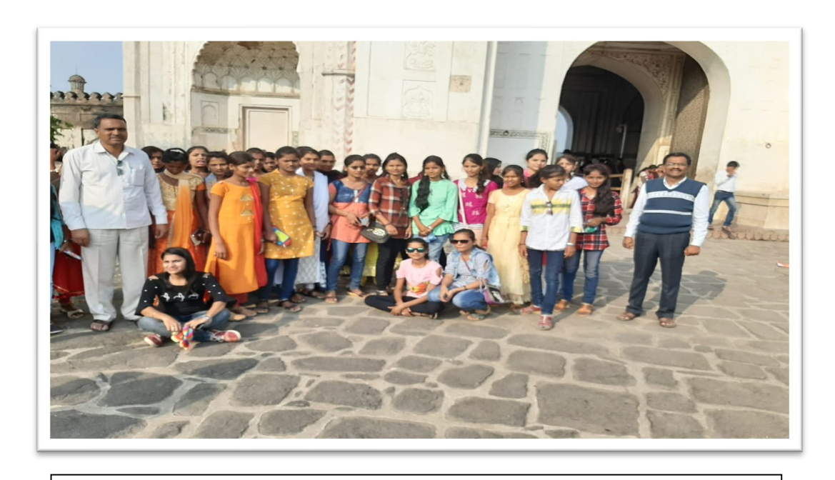
The College Student at Bibi Ka Makbara, Aurangabad.